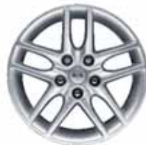
16" 5-Spoke Painted Aluminum Standard on S