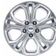
17" Painted Aluminum Standard on SE