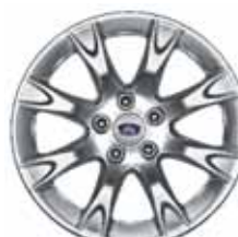
17" Polished Aluminum Included with Luxury Package