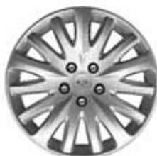
17" 15-Spoke Painted Aluminum Standard