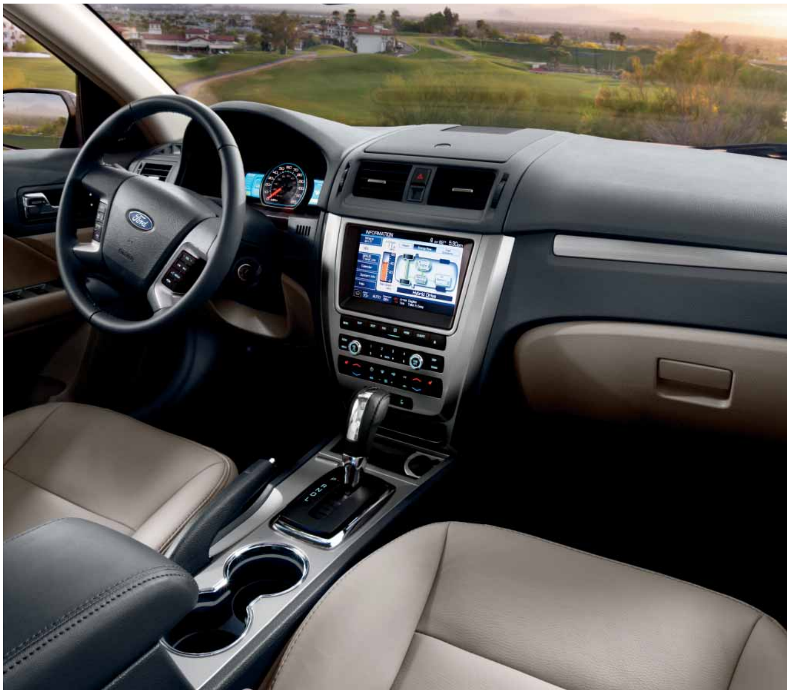
Medium Light Stone leather trim. 2 Available equipment. || Medium Light Stone cloth trim. || Rear view camera. 2 Navigation System. 1,2 || 110-volt power outlet.