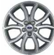
18" Machined Aluminum with Painted Pockets Included with Appearance Package (SE)