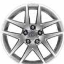
17" 5-Spoke Machined Aluminum Standard