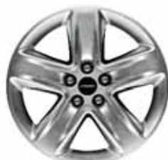
18" 5-Spoke Premium Painted Aluminum Standard