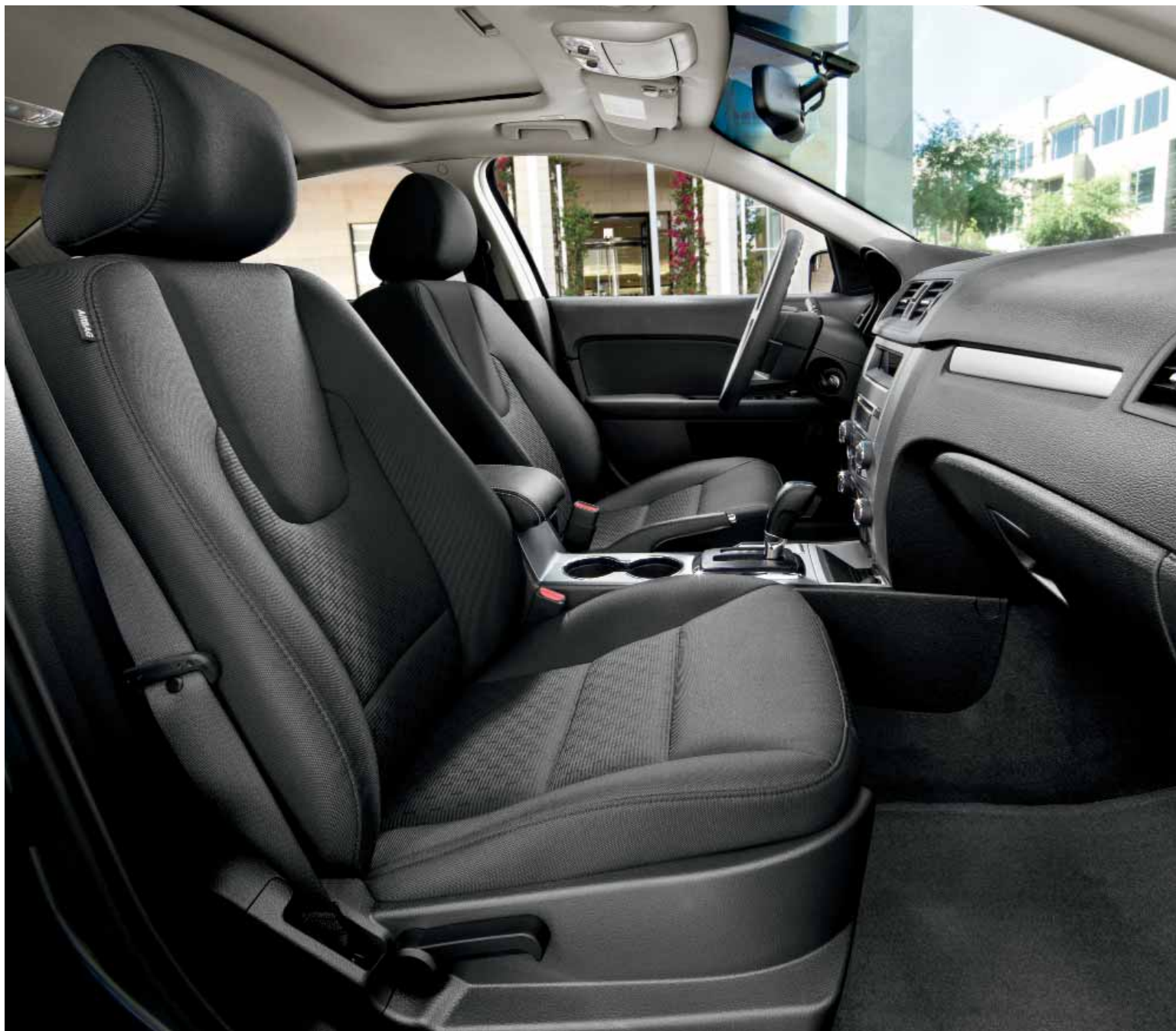
SE. Charcoal Black cloth trim. Available equipment. || Ford SYNC. 1 || Rear-seat center armrest. || SE. 8-way power driver's seat. || Easy Fuel ® capless fuel filler.