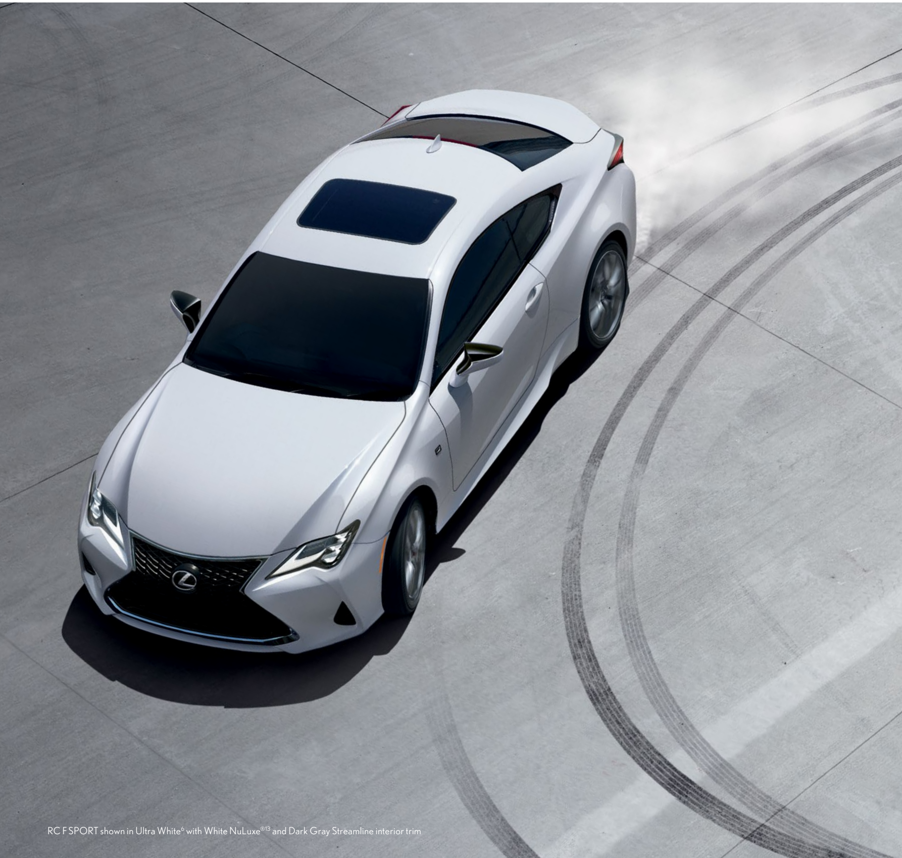
RC F SPORT shown in Ultra White ® with White NuLuxe ® and Dark Gray Streamline interior trim