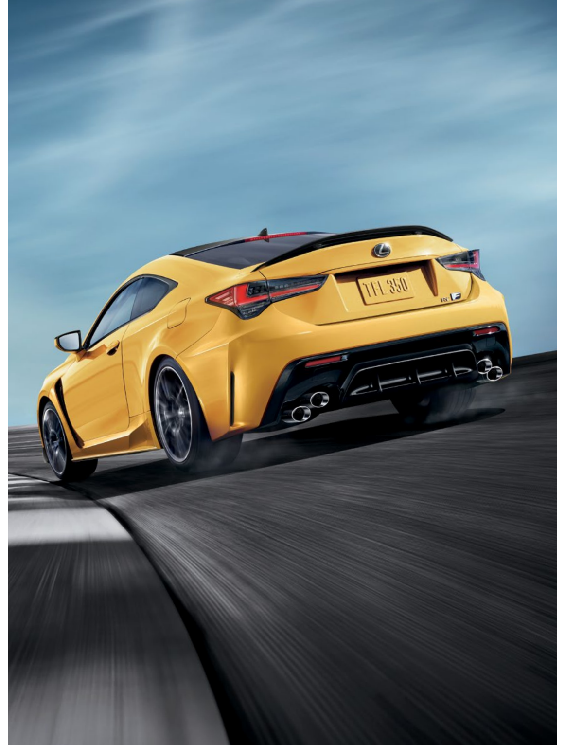
RC F shown in Flare Yellow 6