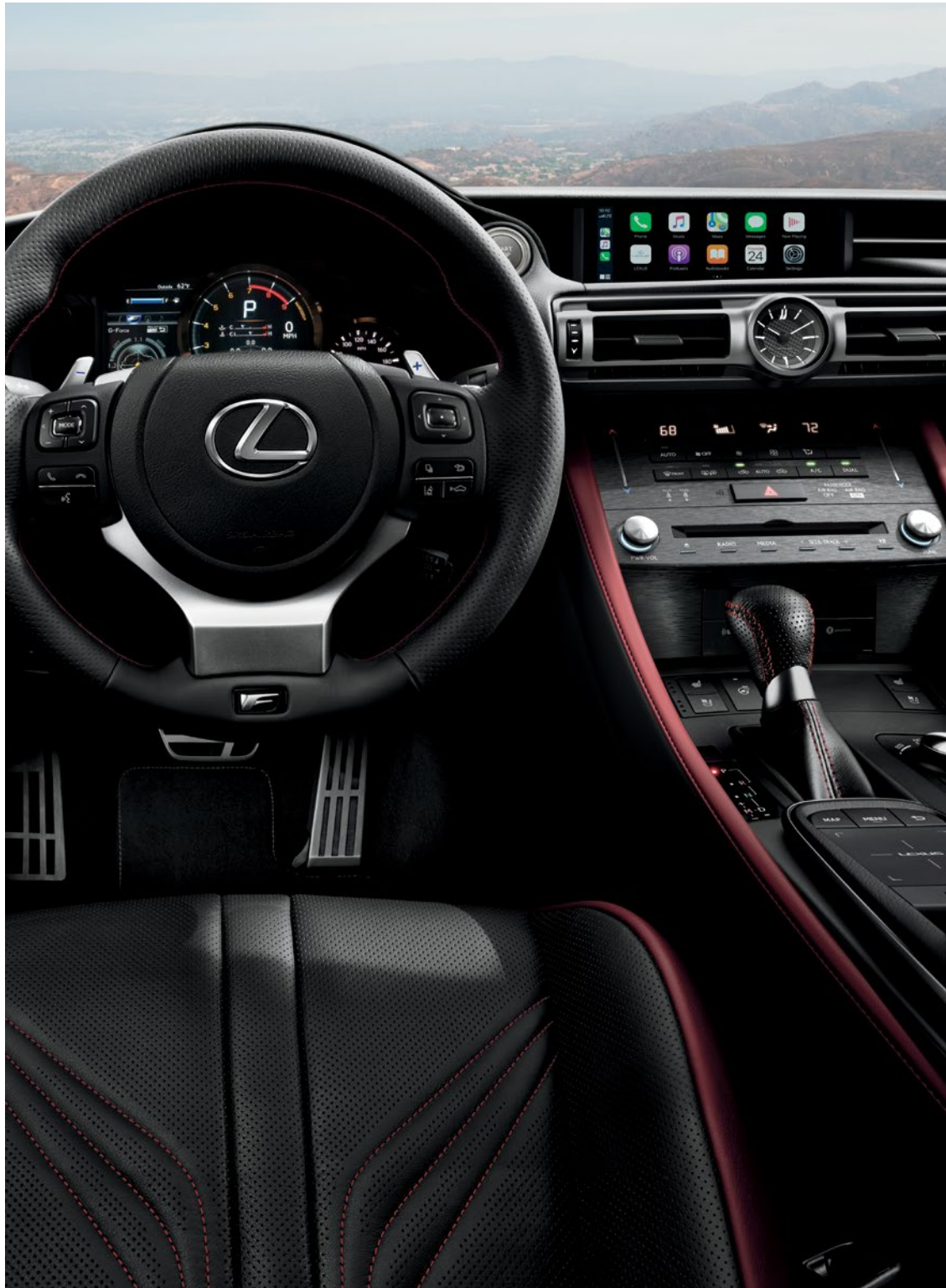
RC F shown with Apple CarPlay ®19 integration and Circuit Red and Black leather interior trim