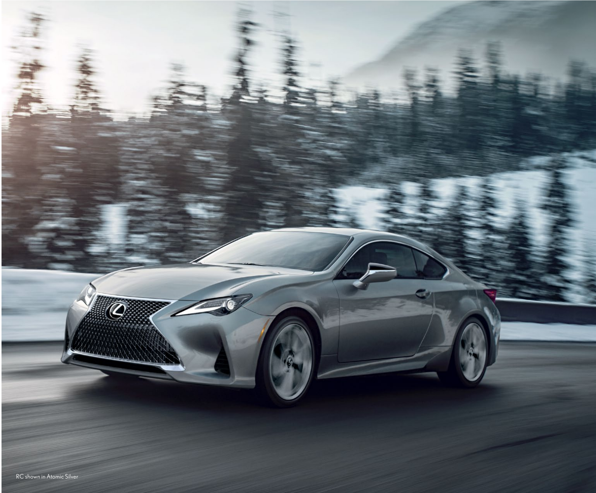
RC shown in Atomic Silver