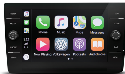
Apple CarPlay integration for your iPhone shown.

VW Car-Net App-Connect allows you to connect your compatible smartphone with Apple CarPlay®, Android Auto™, or MirrorLink® to access select apps on the touchscreen display. From streaming music to mobile apps, it can be accessed on the touchscreen.