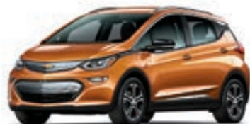
ORANGE BURST METALLIC 3 (With Dark Silver Grille)