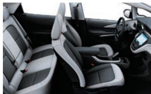
Dark Galvanized Gray/Sky Cool Gray Perforated Leather Appointments 6