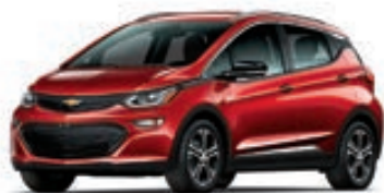
CAJUN RED TINTCOAT 3 (With Black Grille)