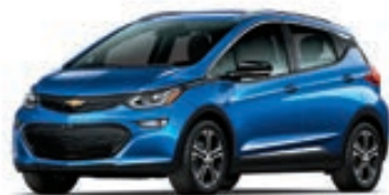
KINETIC BLUE METALLIC 3 (With Black Grille)