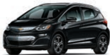
MOSAIC BLACK METALLIC (With Dark Silver Grille)