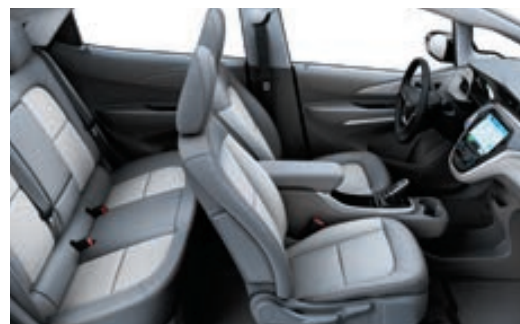
Light Ash Gray/Ceramic White Perforated Leather Appointments 5