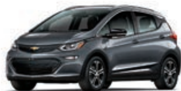
NIGHTFALL GRAY METALLIC (With Black Grille)