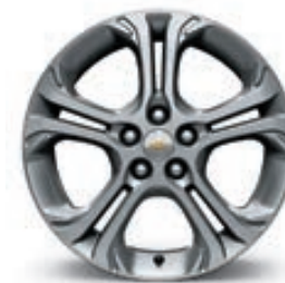
17" Painted-Aluminum (Standard on LT)