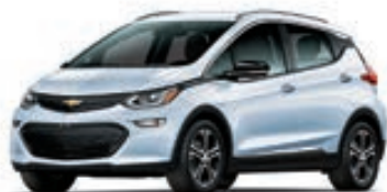
ARCTIC BLUE METALLIC 4 (With Black Grille)