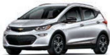
SILVER ICE METALLIC 1,2 (With Black Grille)