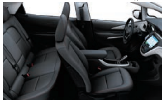
Dark Galvanized Gray Perforated Leather Appointments 6