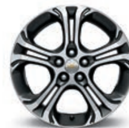
17" Ultra Bright Machined-Aluminum with Painted Pockets (Standard on Premier)