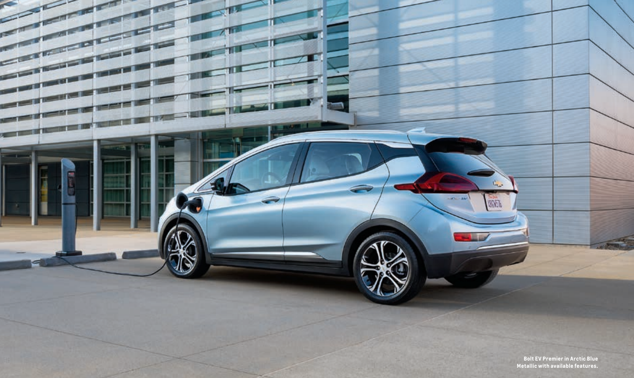
Bolt EV Premier in Arctic Blue Metallic with available features.