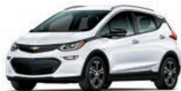
SUMMIT WHITE (With Black Grille)